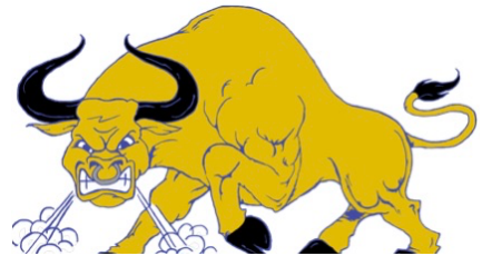
Ersilia Cruz Middle School