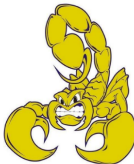
Dolores Huerta Preparatory High